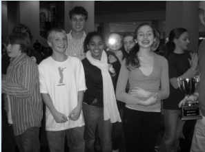
Members of the winning New England Regional Team 2009—Gates Intermediate School

Future City is a competition that urges middle school students to dig deep into their imaginations and create a dream world, and then switch hats to show the world that through innovative technology and engineering, their dream world is possible. The students initially create their world using Sim City 4 software and then build a scale model of a section of their city using recycled products. The students prepare a presentation and brainstorm answers to any question people might ask about their creation. In addition, students are asked to answer an essay question typically aimed